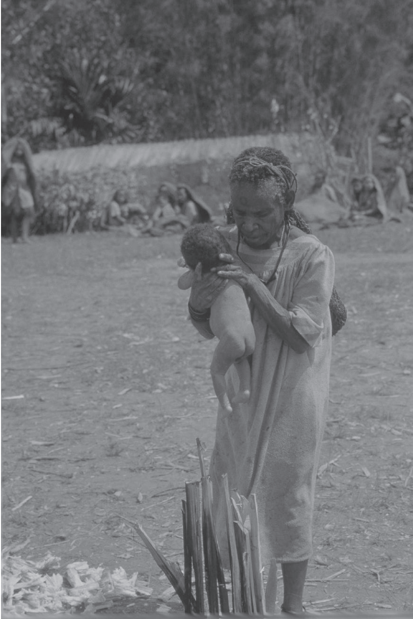
Photo 7. The maternal grandmother of this firstborn passes it over the fire lit with wood from the me'we trunk that the young father has brought down from the forest. © Pierre Lemonnier (June 1997)