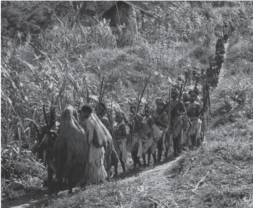
Photo 10. The long line of initiates and their sponsors arrive in the village following the collective rituals of the first two stages. They are greeted by two women, who rub them with the same clay that is smeared on the surwain initiates' shoulders and on the body of newborn babies. © Pascale Bonnemère (November 1994)

In the previous chapters we saw that, years later, when these boys have grown to adulthood and are preparing to receive their first child, their sisters will once again accompany them, again respecting a ban on red pandanus juice and areca nuts, donning, like them, a new bark cape and joining their sisters-in-law for the public phase of the ritual. Alternatively, the role of the mothers is over once the collective phases of the initiations are over.