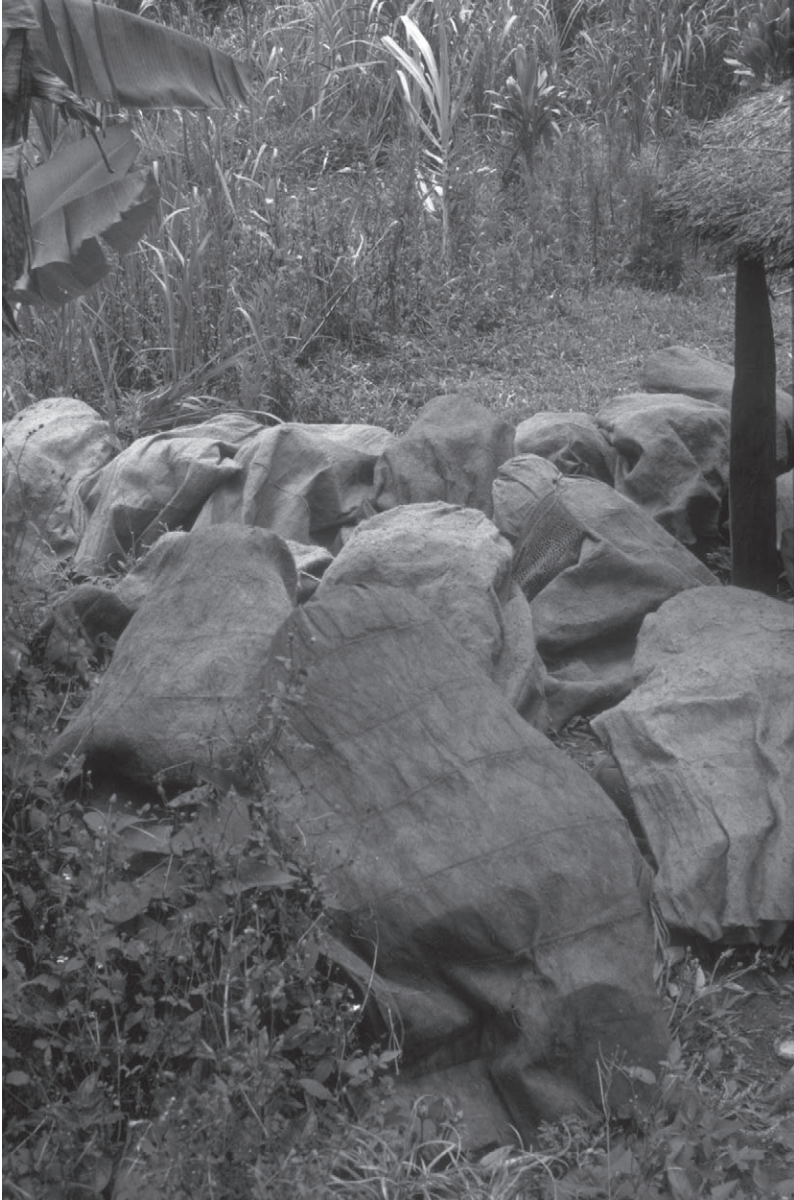
Photo 9. A ritual expert has led the novices' mothers to a place not far from the site where the nose-piercing ritual will soon be held. They must flatten themselves on the ground and cover their bodies with their bark capes, for only the sounds of the ordeal must reach them. In no case can they see what is about to happen.