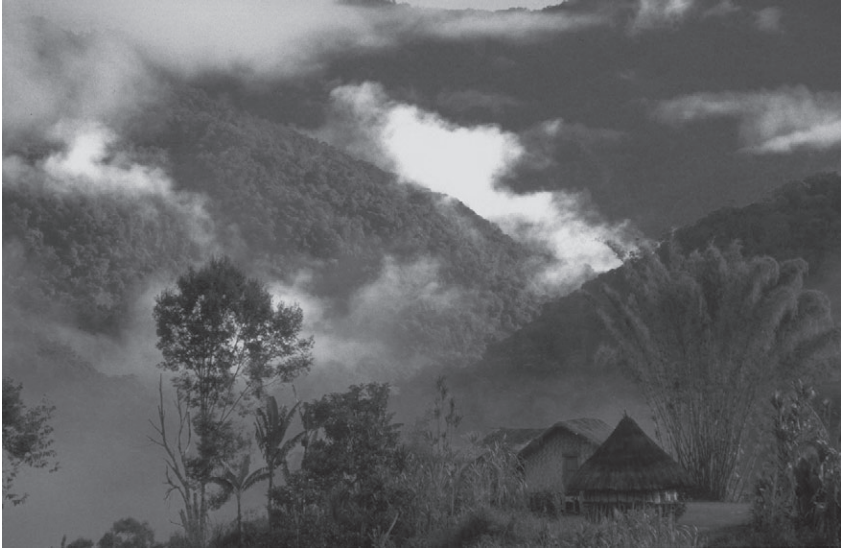
Photo 3. Houses in the hamlet of Ikundi, at dawn.

true for Pangium edule (known as pangi in French and called aamain in Ankave) (see pp. 64–65), takes the form of a ceremony that is akin to the sharing of pieces of pig meat in other parts of the Island, where Big Men once flourished. These figures were renowned for their oratorical talent, which they displayed at large-scale, intergroup competitive exchanges, thus acquiring prestige (A. Strathern 1971; Schneider 2017). The Ankave do not engage in these sort of exchanges and they have no figure even remotely resembling a Big Man, but their distributions of red pandanus sauce and aamain can sometimes have the appearance of a ceremonial gift (see photo 5: the recipient made of a'ki ' leaves in which the tubers are placed, covered in red pandanus sauce, and brought to the guests).