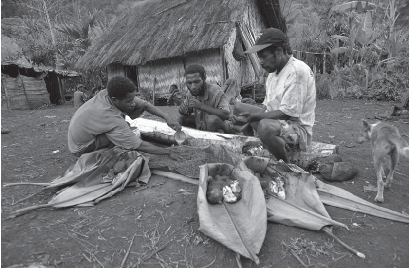
Photo 5. Men press the cooked seeds of the red pandanus to extract the juice, regarded as a vegetal blood substitute. Always consumed poured over tubers, the local staple, it will be consumed collectively, as indicated by the presence of leaf-bowls that will soon be carried to everyone. © Pascale Bonnemère (November 2000)