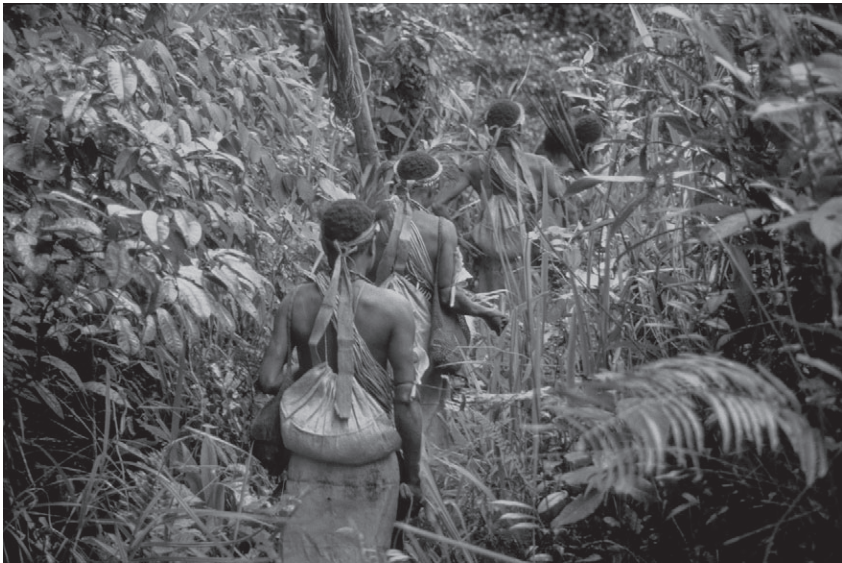
Photo 4. A young father, carrying the me'we trunk at the end of which the ornaments for his wife have been hung, comes down from the forest after having undergone the third-stage suwangain ritual. The two men accompany him because they underwent the same ceremony shortly before. To their feather headdresses they have added a strip of the ogidje cloth which the initiate prepared during his wife's pregnancy. When they emerge from the forest, they will head toward the hamlet of Ayakupna'wa where the public phase of the suwangain ritual will soon take place.