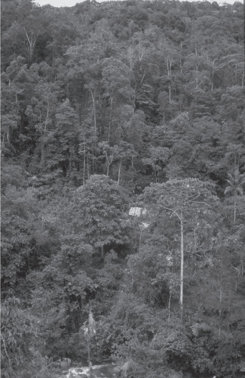
Photo 2. On the bank of one of the rivers flowing through the Suowi Valley, two families have constructed leafy shelters in which they will live for a few weeks, far from their village house.