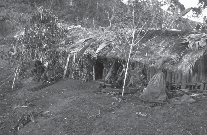
Photo 8. For the duration of the collective rituals, the novices' mothers are secluded together in a big shelter on the outskirts of the village and obliged to adopt certain behaviors and obey prohibitions that are identical to those imposed on their sons secluded in their forest shelter. © Pascale Bonnemère (November 1994)