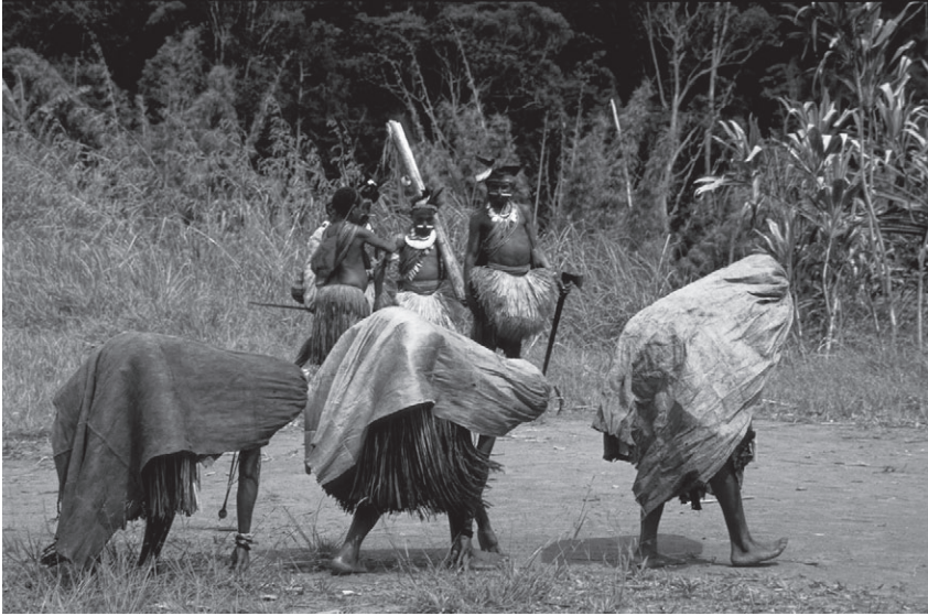
Photo 6. The young father carrying the me'we trunk and his two sponsors must arrive at the same time as his wife, his sister, and the wives of the sponsors at the place where the public phase of the suwangain ritual will take place. A woman greets the men as they come down from the forest, rubbing them with the yellow clay used when the first- and second-stage initiates came out of seclusion, which is the same as that used by mothers to rub on the body of their new baby.

She now looked nothing like a cassowary; she could almost compete in beauty with the men. He and the ritual expert then distributed a few areca nuts from the two varieties that had been gathered in the forest (the wild aobungwen and the cultivated variety), together with lime and daka leaves ( Piper betle ), to the women so that they too might lift the ban on chewing betel a little later.