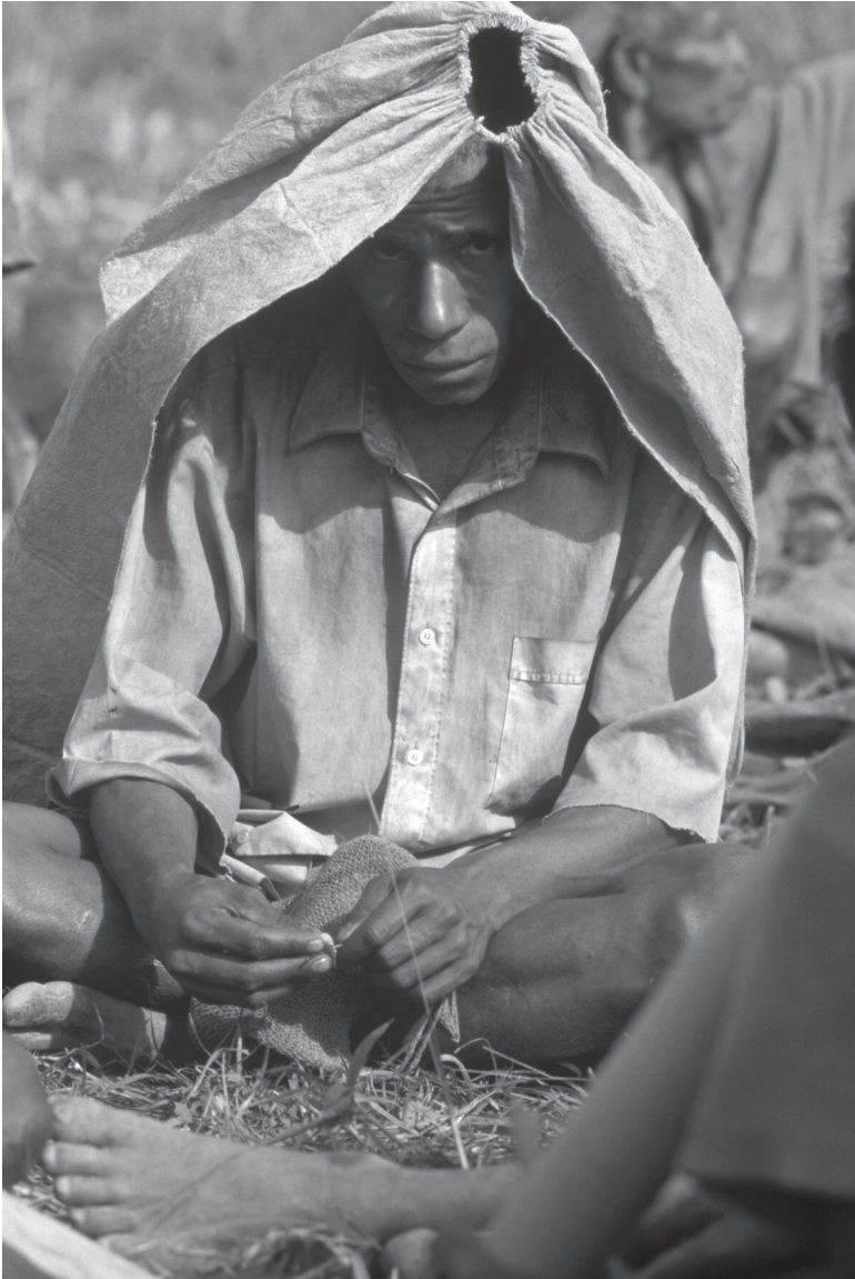
Photo 1. For a man, wearing a bark cape on his head is the sign he is about to become a first-time father. He will have to wear this cape for the duration of his wife's pregnancy and respect a certain number of prohibitions that will place him on the margin of the activities of other men but in relation with his sister and the future mother of his child.