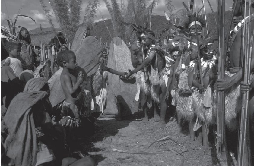
Photo 11. Back in the village, the first- and second-stage initiates give their mothers areca nuts and the few small animals they caught while they were in the forest. In return, their mothers will soon give cooked tubers to them. This exchange indicates that, at the close of the ritual, the nature of their relationship has changed: it has lost the symbiotic character it had in childhood.

What is the nature of the relations revealed by this system of prohibitions and attitudes to which the members of the novice-mother-sister triad are subjected? What the Ankave themselves say sheds light on the specificity of the role of the boys' mothers. During the 1994 initiations, one of the ritual experts told the mothers: "You are one body with your sons." One of the women commented on the fact that they had to respect the food taboos, saying: "We carried him in our belly, this son who is now being initiated, so when he is hungry are you going to eat?" And to explain why the novices' sisters were not obliged to remain immobile during the weeks their brothers' noses were healing, one woman pointed out that they had not given birth to the boys, but "were helping their brothers." 6