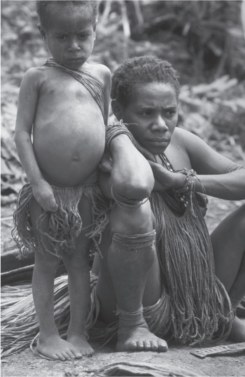
Photo 12. A woman in mourning, unlike a man, covers her whole body with the drab ajiare' ornaments and respects food taboos for a longer time.